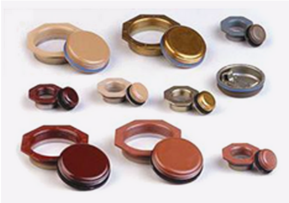
DRUMS STEEL & PLASTIC