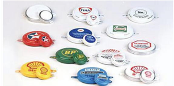
DRUM ACCESSORIES CAPS